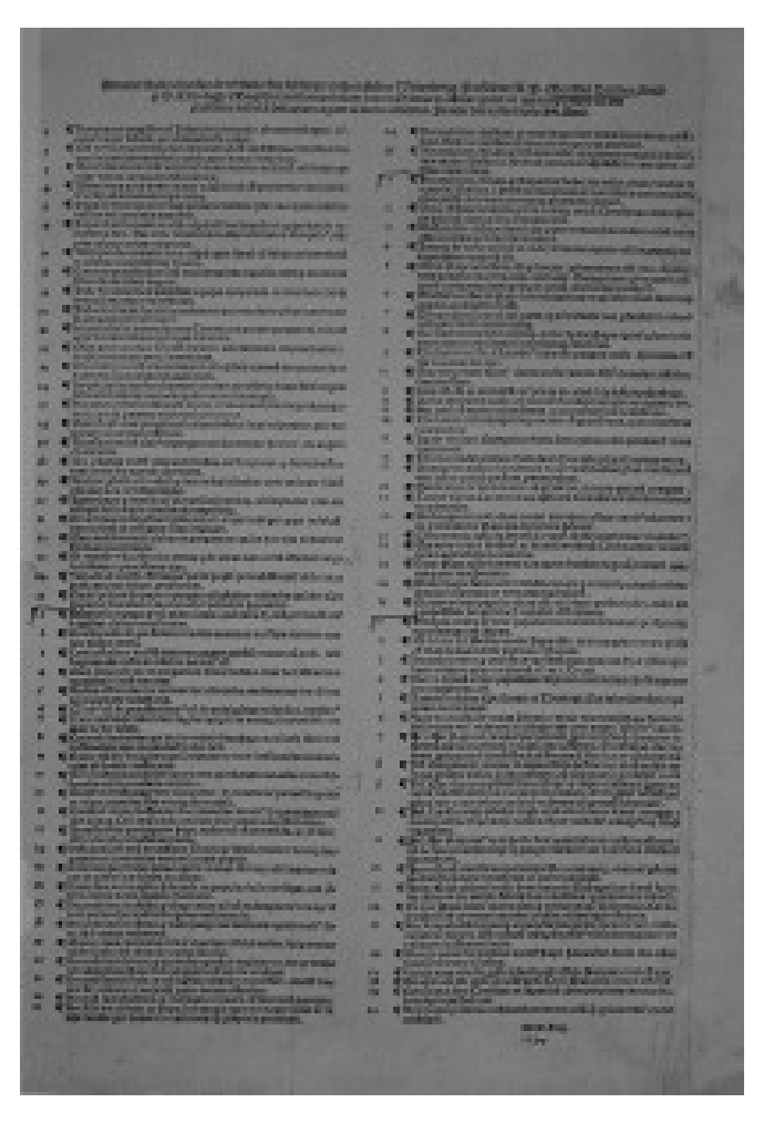
Fig. 1.2 Image of 95 Theses.

authorities of the day, still others found his thought quite convincing. These included Martin Bucer [1591-1551], the future reformer of Strasbourg, and Johannes Brenz, reformer of Schwäbisch Hall and later of Württemberg.